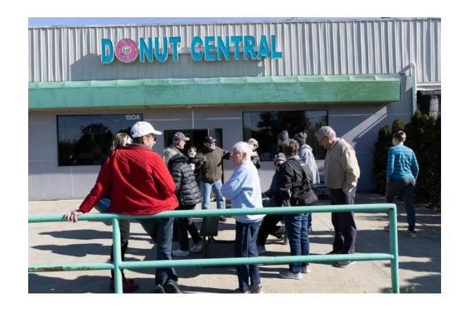
Arriving at Donut Central