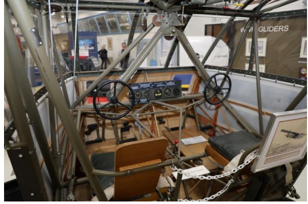
The cockpit for a CG-4A. Pilots trained to fly these at Atterbury. (A very scary assignment!)