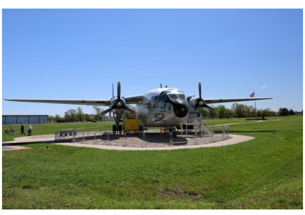
Skip's baby, the C-119.