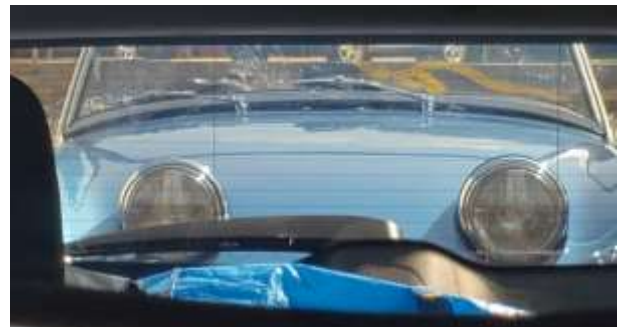
Bev Bush photo.