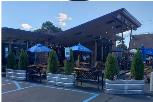
Denver's Garage Pizza and Brews