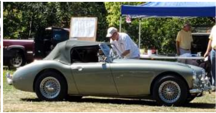
Dayton Best of Show