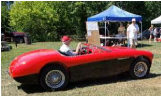
Dayton Class winner 100s

The Dayton show is always a good one, and our club should try to get their Healeys over there.