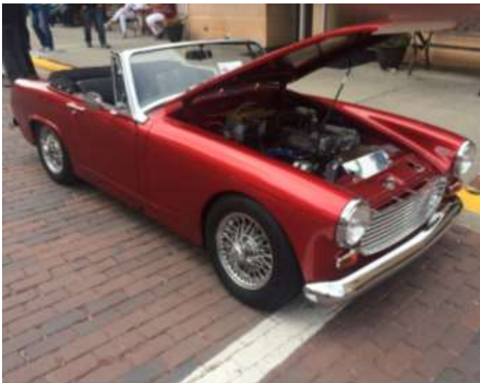
The Conclave location brought in cars we don't normally see in the flatlands, such as this gorgeous Sprite from Utah. It gave Jim Switzer ideas for his car's build.