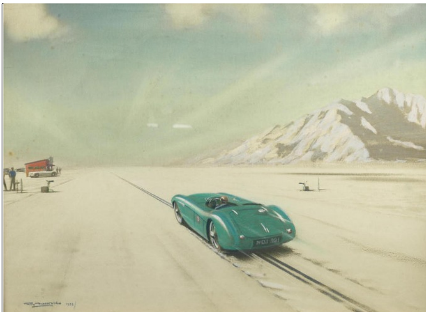
A painting by Roy Nockolds of Bonneville in 1953