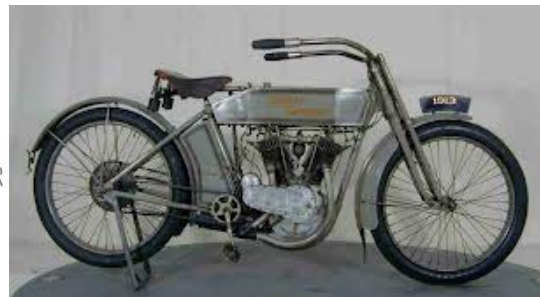
1913 Harley Davidson