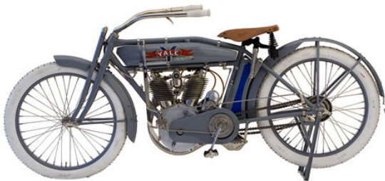
1913 Yale Motorcycle