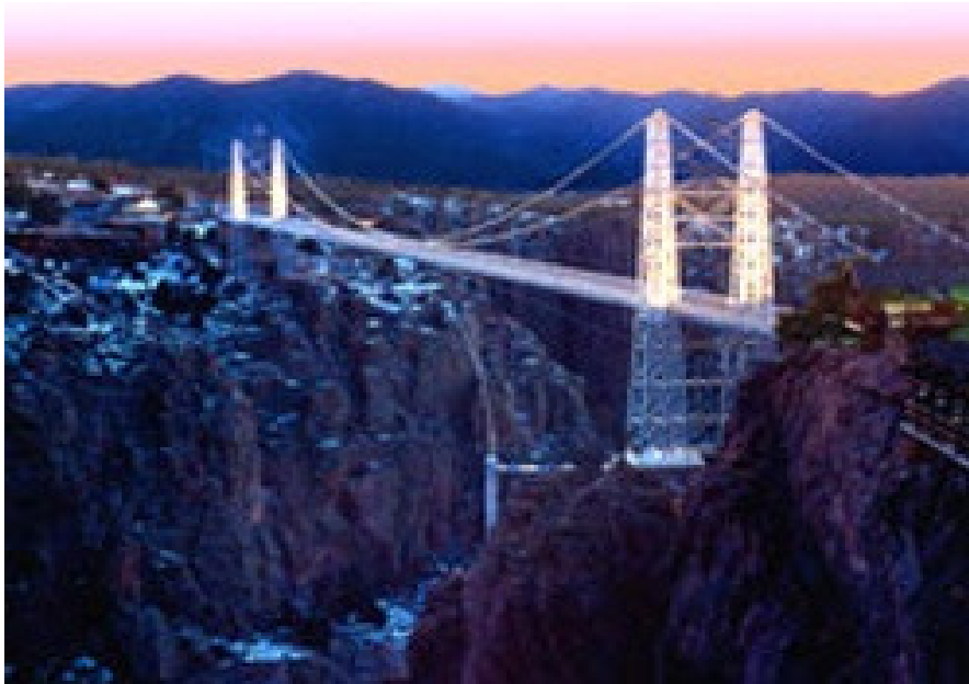
The Royal Gorge Bridge

Train ride through the Gorge - Royal Gorge Bridge and Park Zoo www.royalgorgeroute.com