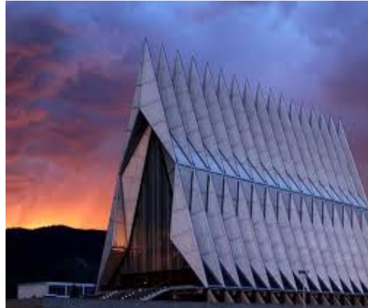
The Chapel at the Air Force Academy

6374 Columbia Circle Fishers IN 46038 (317) 576-9178