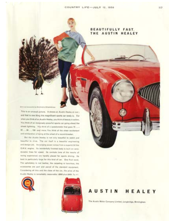
Above right: This stylistic ad appeared in the July 12, 1956 Country Life magazine